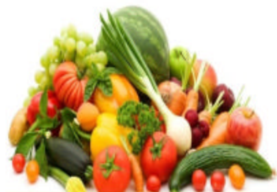
Fiber Food Reduce Constipation Bloating